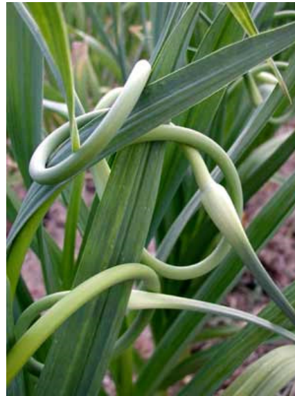
Garlic plants with the curly scape, twisting in a characteristic shape.